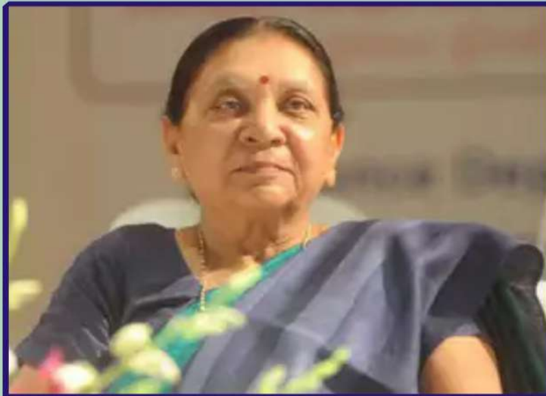
Mrs. Anandiben Patel Hon'ble Governor, Uttar Pradesh(India) Hon'ble Keynote Speaker